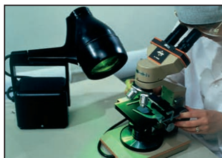
B-100YP produces high contrast light for fine surface particle detection

Dimensions: B-100YP: Lamp Head 9.75D x 6Dia in. (248 x 152mm) Weight: 12.48 lb. (5.67 kg)