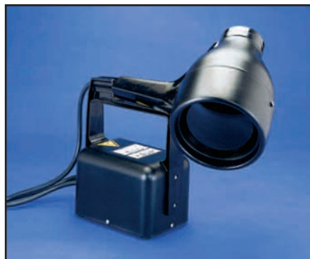
B-100A Pistol-grip handle balances the lamp comfortably in the hand.

Dimensions: B-100A, B-100A/R: Lamp Head 8.5L x 5.5Dia. in. (216 x 140mm) Weight: 11.72lb (5.33kg)