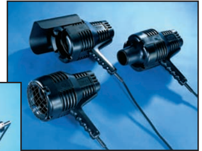
The funnel directs the UV source to a specific location. The visor shields the user from the blue haze emitted from the lamp.

From left to right: Finger guard, visor, funnel. Below: Exposure Box