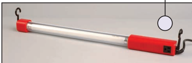
BL-15 with a narrow, durable plastic housing

Dimensions: 20L x 2Dia in. (508 x 50.8mm) Weight: 2.5 lb (1.1kg)