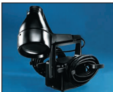
B-100A/R includes 20 ft. (6.1 m) primary and secondary cords for additional mobility.