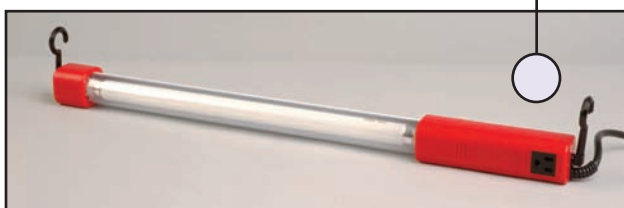
BL-15 with a narrow, durable plastic housing

Dimensions: 20L x 2Dia in. (508 x 50.8mm) Weight: 2.5 lb (1.1kg)